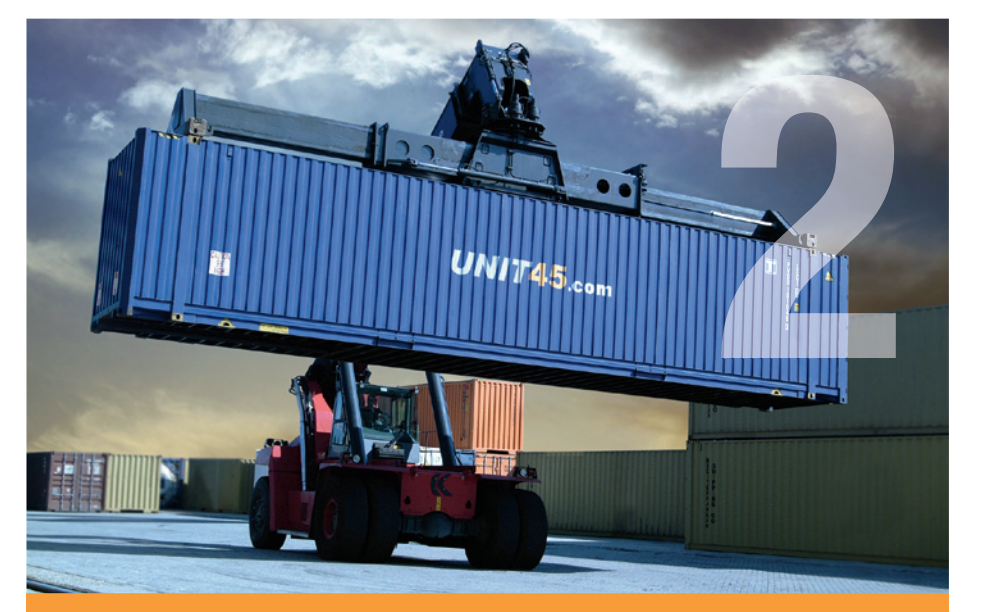
The UNIT45 dry container, a standard unit that provides the highest cubic capacity and payload of any standard 45ft container design

weight flooring materials such as bamboo and laminated birch and extra high-strength steel grades." The result is a 45ft container that weighs 600 kg less than a container this size would normally weigh. Weight is a decisive factor for transport on the road, also in view of the currently valid weight limitations, says Mr.