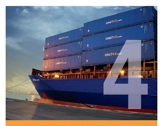
Larger volumes mean speedier transhipment, so the UNIT45ft container is a familiar sight in short sea shipping