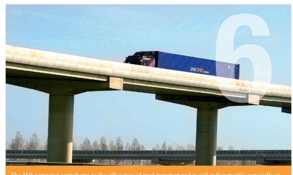
e start or the end of the distribution chain

container that can be loaded from the side. The UNIT45 curtain-sided unit features a patented base structure that provides a side aperture height of 2,394 mm between floor and top rail. Customers can choose between different types for loading/ unloading from two or three sides. The first of its kind in Europe with sufficient cargo capacity to handle 33 europallets, the lightweight UNIT45 reefer container can be supplied with a built-in cooling system, providing maximum performance and excellent energy-economy. UNIT45 offers the all-electric reefer, as well as the diesel-electric reefer, which makes refrigerated transport by rail available to clients who were