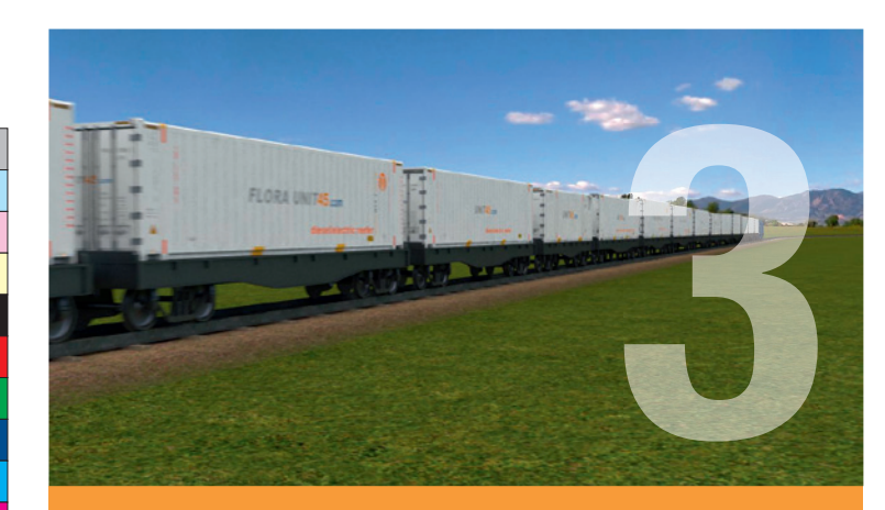
Switching effortlessly between rail, road and water: UNIT45 containers are ideal for intermodal transport

The company's future-oriented designs have been patented for proprietary use. A customer portfolio that includes prestigious names in the industry such as A2B Online, Samskip, BG Freight, H.E.S.S., Transfennica, ECS, J.S.V., Valo and P&O Ferrymasters confirms its leadership position. Special features such as designs incorporating customers' colours, galvanized components and structural modifications are part of a support and service program that leaves nothing to be desired. "We may be a small business in terms