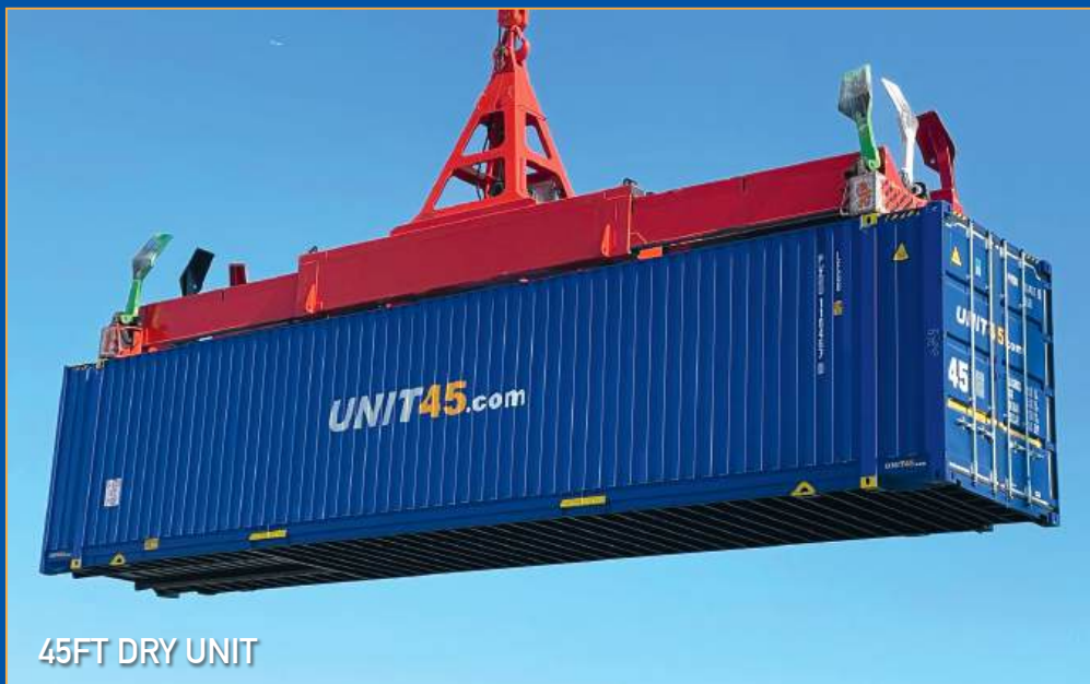
45FT DRY UNIT